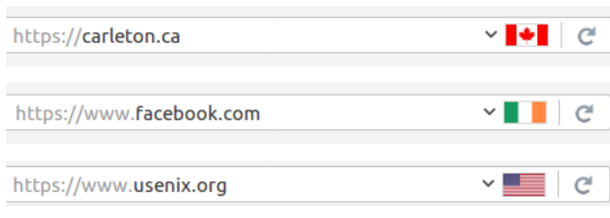
Figure 1 [a-c]: Snapshots of the Flagfox browser extension