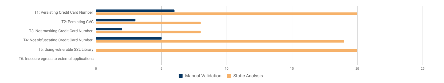
Figure 3: Number of PCI DSS non-compliant applications for different tests.

Ben's Soft Pretzels (com.rt7mobilereward.app.benspretze-1) with over 10k+ downloads was also writing the CVC to the device logs. Another toll application called FastToll Illinois (com.pragmistic.fasttoll) is used to pay tolls acquired within Illinois and has over 10k+ downloads. Cardpliance identified that this application was persisting the CVC in the shared preferences of the application.